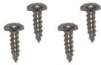
4 Phillips Head Screws