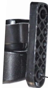
Use as template